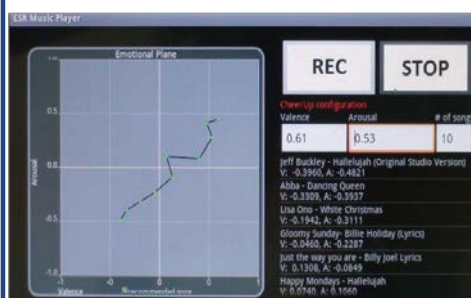
A screen capture of the music player

This strategy allows the system to automatically select a piece of music from a database of songs, in which emotions are also expressed using arousal and valences values. Furthermore, a cheer-up strategy is proposed where in case the detected emotional content is detected as negative, music songs with varying emotional content are played in order to cheer-up the user to a more neutral –happy state. The system has been implemented in a popular inexpensive embedded platform Beagleboard XM which uses an electret microphone and a touch screen panel as input from the user. The proposed system can be used in human-machine interface applications like companion robots, car sound systems and communication devices like cellphones, where music can be played according to user's emotional state.